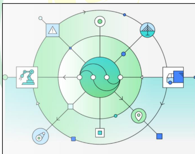
Fig. 1: Artificial Intelligence (AI) and Machine Learning (ML)

Artificial intelligence is powerful technology that encompasses computers and machines to simulate the intelligence of human to solve specific problem on the basis of logical reasoning and fast experiences. As a field of computer science, AI enables machine learning and deep learning (Fig. 1). These two disciplines involve to develop AI algorithms, then models after the decision-making processes of the human brain or intellectual which is 'learn' from existing data and make progressively very high accurate simulations, classifications or predictions over time. Digital assistants, autonomous vehicles, GPS guidance and generative AI tools such as Chat GPT, Open AI are some examples of Artificial Intelligence in our daily lives and the daily news.