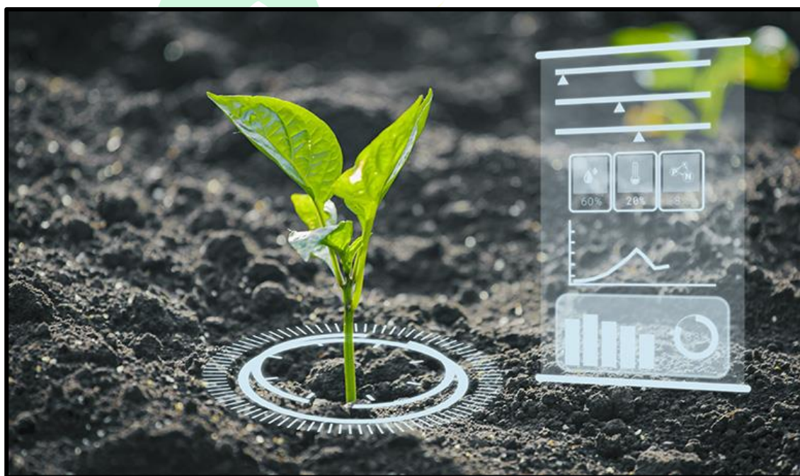
Fig. 2: AI-enabled crop health monitoring