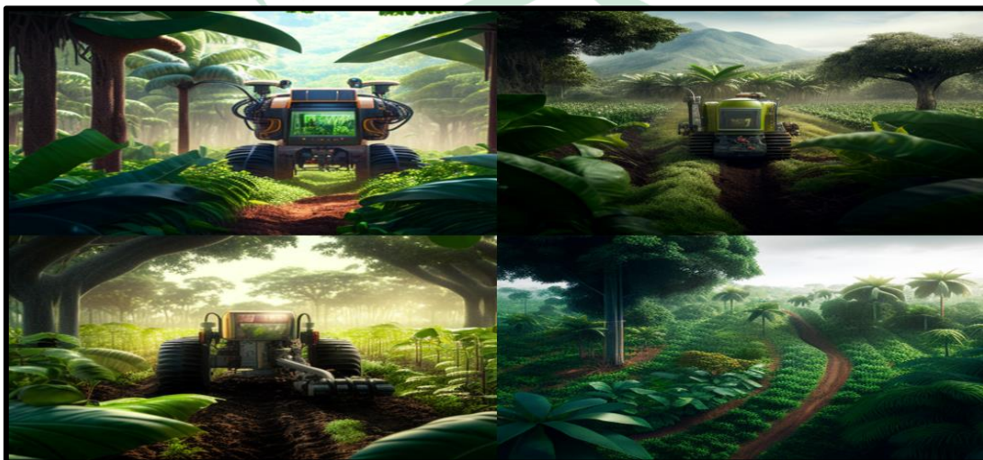
Fig. 4: Robots enabled with AI in Agroforestry

AI is definitely playing an increasingly huge role in agriculture as well as agroforestry and food security with sustainability over the upcoming years. AI-enabled technologies have always been at the forefront of agriculture and agroforestry such as from primitive tools and implementations to irrigation to tractors to drones to robots to AI. This is also called as Smart Farming (Charania and Li, 2020). Every development of technology and its advancement has increased efficiency with accuracy while reducing the challenges of green farming all around the world (Fig. 4). AI has the modern tools to address various challenges posed by climate change, global warming, environmental issues, and an increasing demand for food and nutrition. It will revolutionize modern agriculture and agroforestry by improving efficiency with accuracy, sustainability, management, resource allocation on top of real-time monitoring and predictions for healthier and higher-quality food produce.